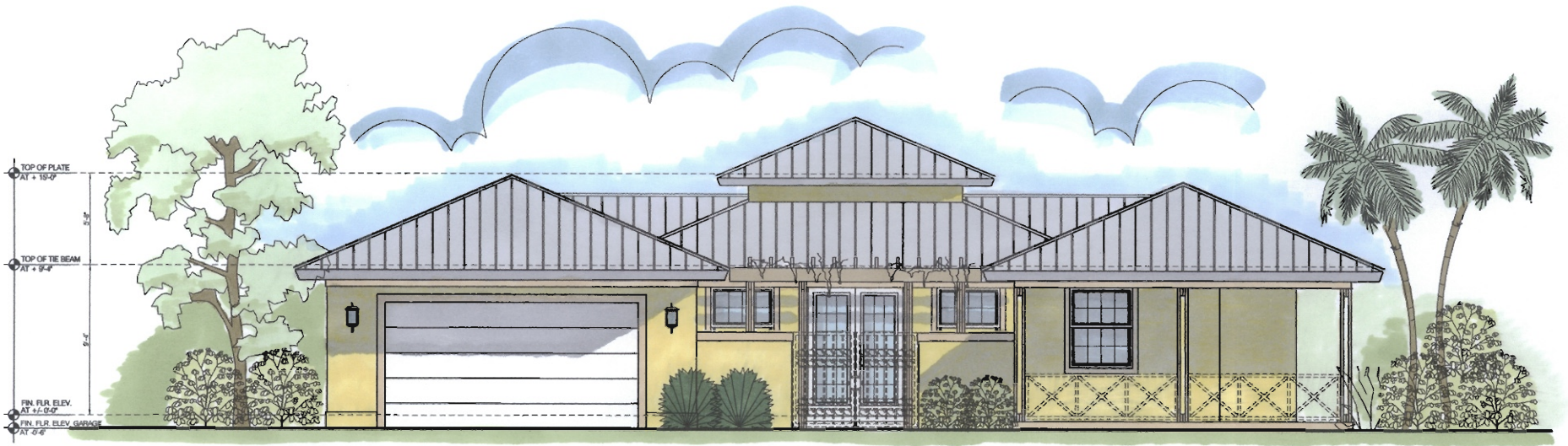
ELEVATION - OPTION 2